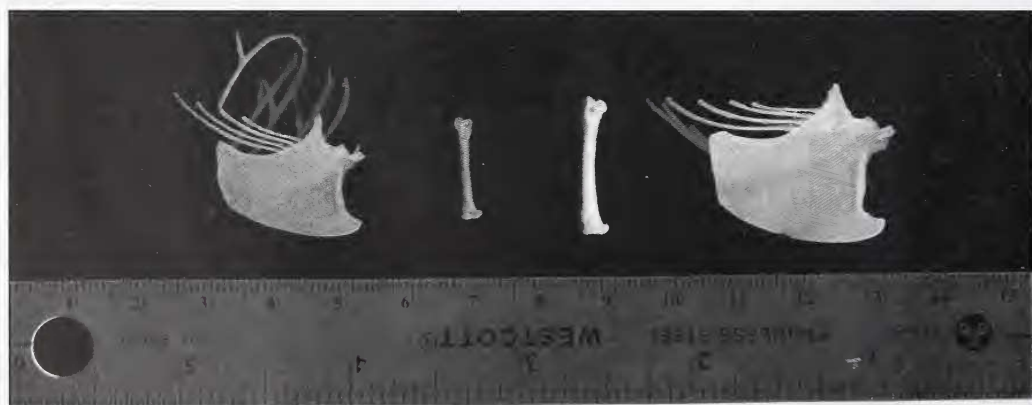
O. leucorhoa USNM 346545

Leach's Storm Petrel disperses south to equatorial regions after breeding and at this time individuals often undergo moult (Crossin 1974, Spear & Ainley 2007). There are a handful of records of O. leucorhoa from Costa Rica (Slud 1979) and the Galápagos (Harris 1973). Harrison (1983) stated that the 'limits of southwards dispersal [are] not known but probably S to Peru' but did not show the species occurring in South American waters in his distribution map. Pitman (1986) and Erize et al. 's (2006) distribution maps show the species to occur broadly across Colombian Pacific waters, Spear & Ainley (2007) list the distribution of dark-rumped O. leucorhoa as far south as 10°S and Hilty & Brown (1986) considered that it 'should be found' in the Colombian Pacific. However, there are no previous published Colombian records (Salaman et al. 2008). The larger Markham's Storm Petrel O. markhami and Black Storm Petrel O. melania have similar plumage to the dark-rumped races of O. leu-